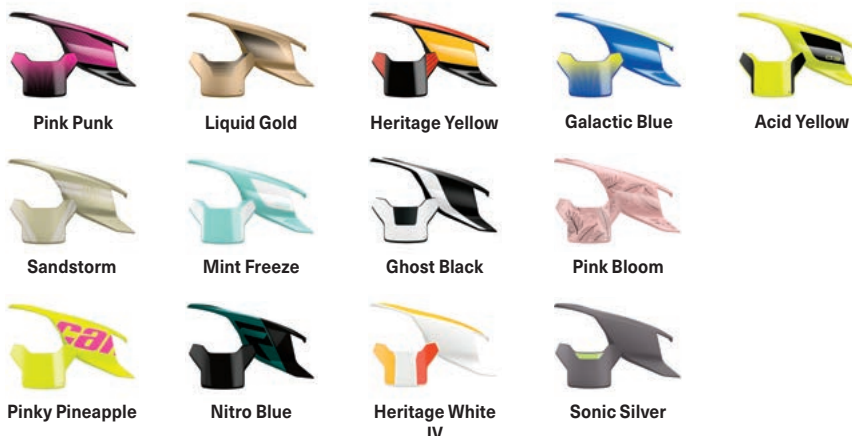
Pink Punk Liquid Gold Heritage Yellow Galactic Blue Acid Yellow Sandstorm Mint Freeze Ghost Black Pink Bloom Pinky Pineapple Nitro Blue Heritage White IV Sonic Silver