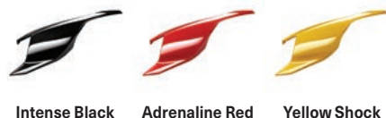
Intense Black Adrenaline Red Yellow Shock