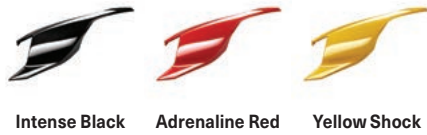
Intense Black Adrenaline Red Yellow Shock