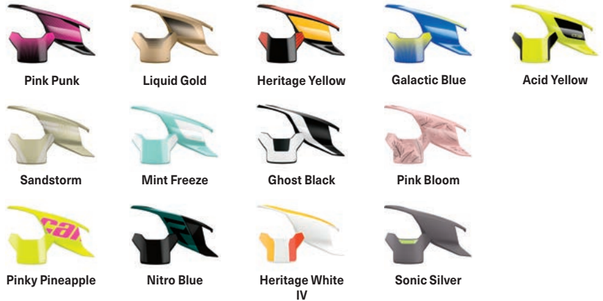
Pink Punk Liquid Gold Heritage Yellow Galactic Blue Acid Yellow