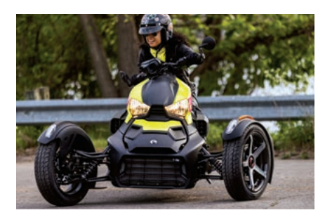
SPORT MODE Allows you to have more fun on paved roads. Sport mode loosens the traction control of the rear wheel, enabling you to perform controlled drifts.

MAX MOUNT STRUCTURE Makes the unit 1+1 ready. It also increases the carrying capacity for different storage options.