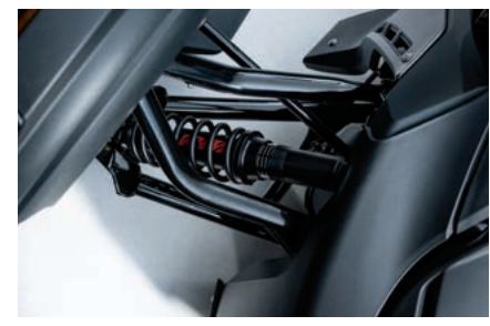
FULL KYB HPG SHOCKS Front and rear KYB HPG shocks with rear remote adjuster for different riding experiences.