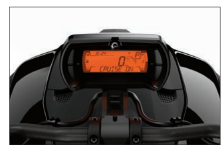
CRUISE CONTROL No need to hold the throttle at all times, the cruise control can be switched on to maintain a selected speed.