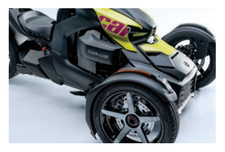
SPORT-STYLE TRIMS AND FINISHES Modern design with a sleeker look for sport-style enthusiasts.

DRIVESHAFT Highly durable and robust driveshaft technology will help you enjoy a smooth ride all along the way. No need for further adjustment, alignment or maintenance.