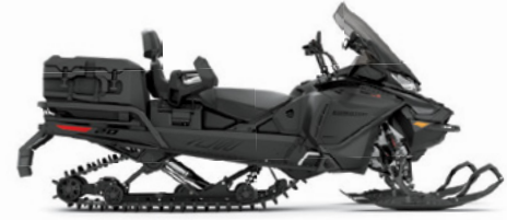
EXPEDITION SE 900 ACE TURBO SHOWN

The utmost touring sport-utility vehicle with an incredible list of work and luxury features.