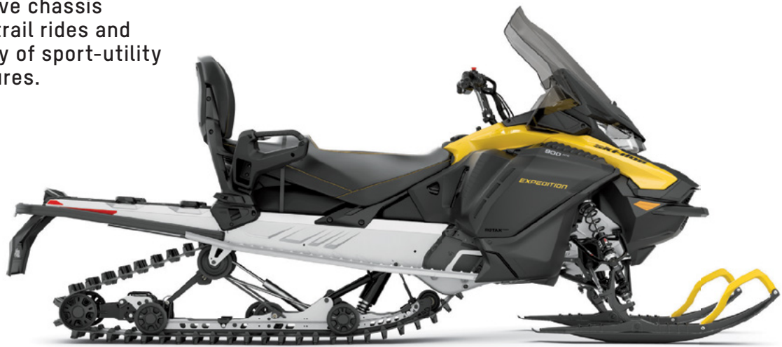
EXPEDITION SPORT 900 ACE SHOWN

Ultra-responsive chassis for on- or off-trail rides and extensive array of sport-utility and 2-up features.