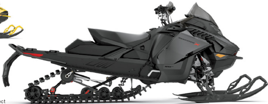
RENEGADE X 850 E-TEC SHOWN