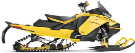
RENEGADE X 600R E-TEC SHOWN

High-performance and high-tech features for the most demanding rider.