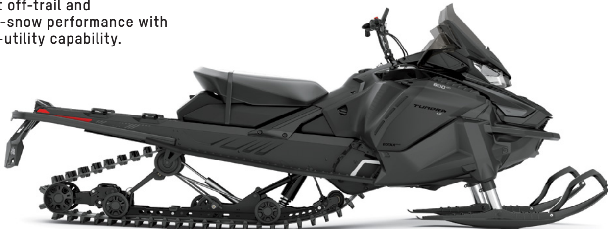
TUNDRA LT 600 ACE SHOWN

Great off-trail and deep-snow performance with light-utility capability.