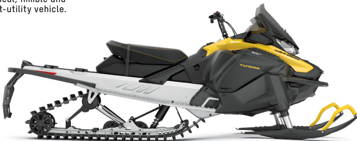
TUNDRA SPORT 600 ACE SHOWN

Economical, nimble and fun light-utility vehicle.